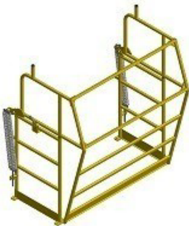
Single Width Rollover Pallet Gate