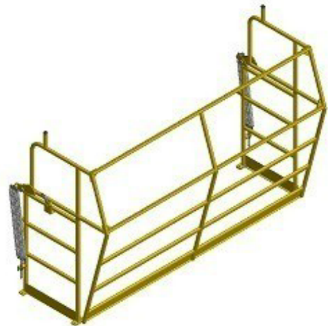
Double Width Rollover Pallet Gate